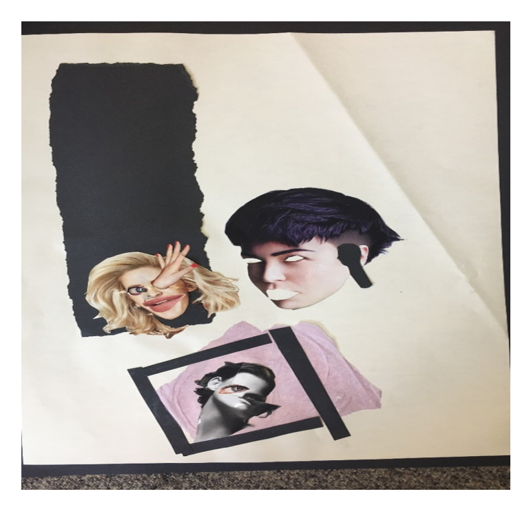
Figure 3: 'No right to see' (collage title, Huddersfield)

In discussions participants drew from their post-it notes to explain how the masculine and feminine representations were teaching them to believe 'women were weak, bidding creatures' (England) and to see men as 'muscularity [with the] right to dominate and control the world, including women' (Canada). The intersectionality of gender and class was also illuminated in observations, much like Porter (1991), of domestic women staff missing from the domestic portrayals, albeit the middle and upper class women featured were primarily engaged in "feminine" occupations of embroidery or genteel rituals of toilette. On this latter, a number of participants queried: 'What else did women do besides sit around in pretty clothes?' (England); 'Did women in the past do anything besides dress pretty?' (Canada). Debriefings focussed on how "disempowering" it was to see women either dismissed 'if they are in my class', one woman noted, or simply confined to doing "nothing". This raised the topic of the women's movement (including suffrage) and this was significant as many participants had not aligned themselves with the women's movement, nor feminism which one participant had queried before the Hack as 'really outdated and not really very necessary, right?'.