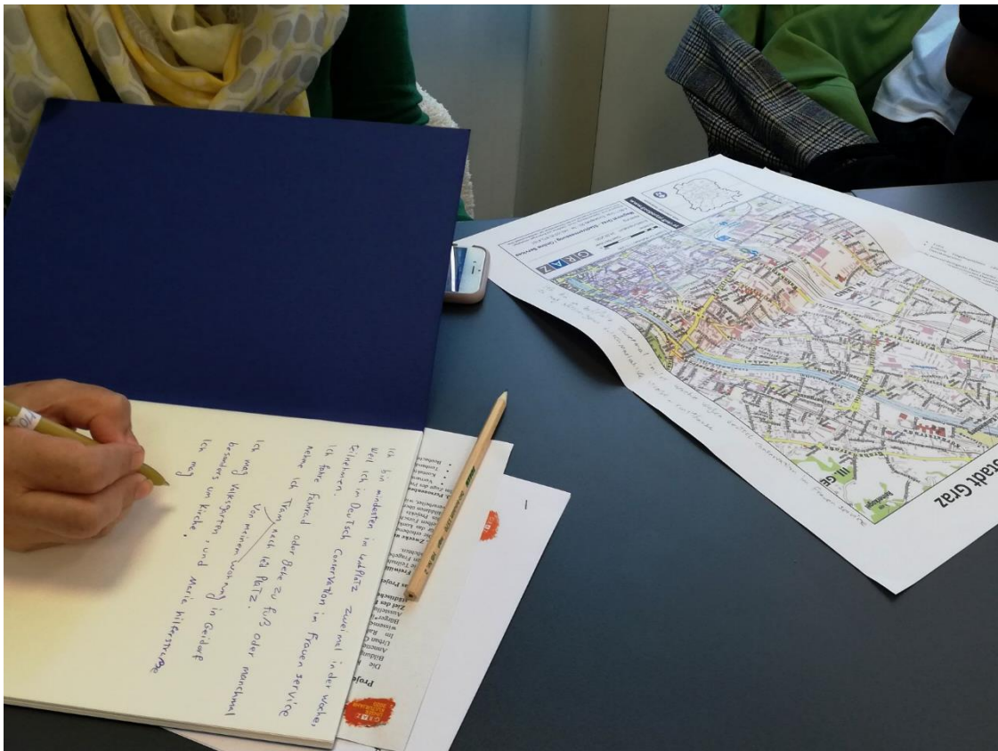
Figure 1. Activity within the Living Lab: Mapping the district.

In doing this, the spatial dimension of their lived citizenship was brought to the fore. Multiple women mentioned the traffic situation, and how they felt discriminated against or even threatened as pedestrians. Furthermore, they articulated a need for safer and more comfortable bus stops: ‘The situation at the many bus stops is totally uncomfortable with all the cars directly there, a very small sidewalk, no shade at all, and then you are standing there with little children.’ (woman MAN, workshop [ws] 2 4 ). In discussing their needs and emotions in connection with certain issues and places in the city, the affective aspects of being a citizen became visible. The women talked about their positive experiences with local NGOs and community centres in the area, where they liked to go to meet new friends, take language or sport classes and participate in dance festivals during summer. The performative dimensions of citizenship were demonstrated through taking ownership of their district, and by creating a public exhibit to reflect their utopias. To illustrate this, one object from the exhibit is depicted here (see Figure 2).