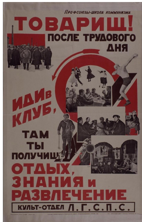
Figure 6. Comrade! After a Hard Day, Go to the Club, Where You Will Get Rest, Knowledge and Entertainment.

Cultural literacy. Increasing the cultural level of the population was at the heart of the socialist project. Basic academic literacy and reading was part of it. Other avenues of cultural literacy involved healthy lifestyle knowledge, and learning arts, music, and drama. The poster below, for example, invites workers to attend a workers' club to 'get a rest, knowledge and entertainment' (Figure 6). The central pictures present the club's activities: socialising over a meal, dancing, doing sports (figure of a man throwing a discus, and another man skiing), listening to the radio, playing musical instruments, reading, and playing checkers.