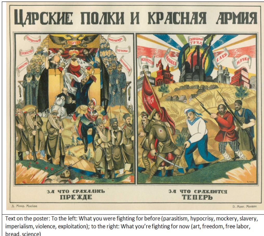
Figure 2. Royal Regiments and the Red Army . (Moor, 1919).

imperialism, violence, and exploitation. In the second picture, the throne and its surrounding sycophants are removed, and the viewer can clearly see what the tsarist regime was blocking common people from – in the background, there are multiple-storey buildings with the titles Arts, Freedom, Free from Exploitation Labour, Bread, and Science .