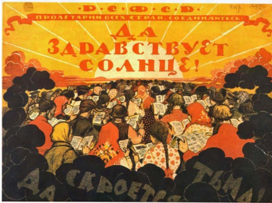
Figure 3. Long Live the Sun! May the Darkness Disappear! (Simakov, 1921).

The image of the sun is also a reference to the ideas of the 17-century enlightenment. The term enlightenment ( prosveschenie in Russian) embraces a number of meanings. It is not only ‘a European intellectual movement of the late 17th and 18th centuries emphasising reason and individualism rather than tradition’ and ‘the action of enlightening or the state of being enlightened’ (‘Enlightenment,’ 2020), but also knowledge (Ozhegov & Shvedova, 1997) and ‘the dissemination of knowledge, education, and culture’ (The Great Academic Dictionary of the Russian Language, n/d, p. 1343), as well as the system of education in general (e.g. the ministry of education was titled the ‘Ministry of Enlightenment’). The representation of the rising or shining sun in some of the posters thus indicates the role of education and learning in constructing a new society and state full of the ‘light’ of new knowledge.