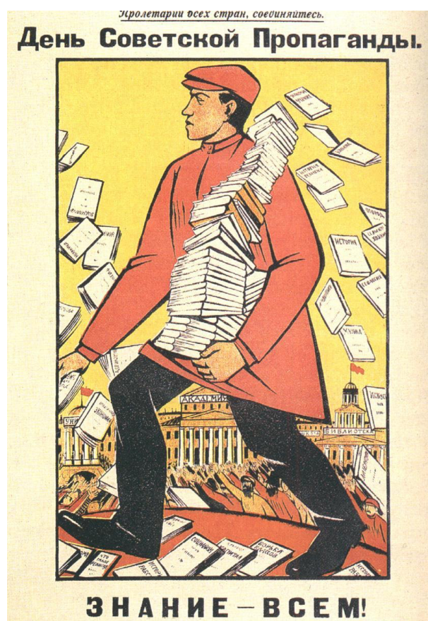
Figure 7. The Day of Soviet Propaganda. Knowledge – to All! Unknown artist, 1920.

One of the most prominent authorities among party-state knowledge holders represented on the posters of 1917-1928 was Lenin, whose words were quoted multiple times. He was also mentioned on posters as ‘Ilyich and his covenants’ (Lenin’s real name was Vladimir Ilyich Ulyanov). Portraits of both Lenin and Marx are also central to some of the posters. One of the early posters introduces a Communist Party member in the role of a Propagandist – an educator channelling party knowledge among the masses. On the poster is a man of exaggerated size, tossing books out to the masses to catch: ‘Knowledge to all!’ states the poster (Figure 7).