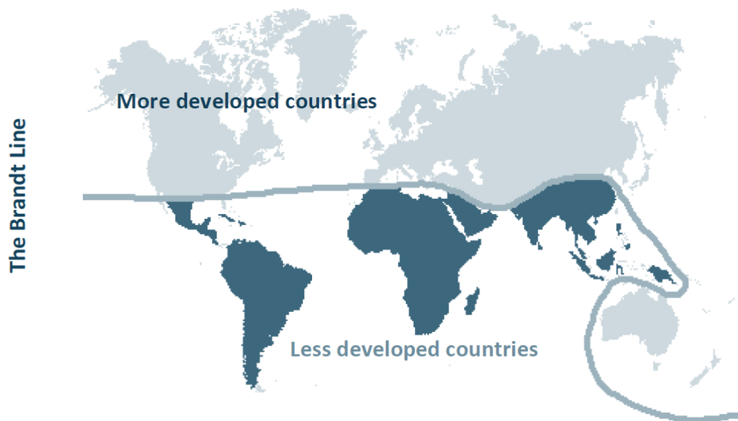
Figure 1: The Brandt Line (Royal Geographical Society, www.rgs.org ) 3

Referring to Martinez the notion about the South relies on conventions: 'By convention, the bottom half of a map is South' (2012). Maps have not always been oriented this way. The word 'orientation' points to the Orient (Jerusalem), and not the North. Famous maps between 800 and 1500 AC were round and flat, had Jerusalem in the centre, Asia in the top area, Europe down left and Africa down right. The first compasses were invented in China. They pointed to the South (Needham 1962, p. 229).