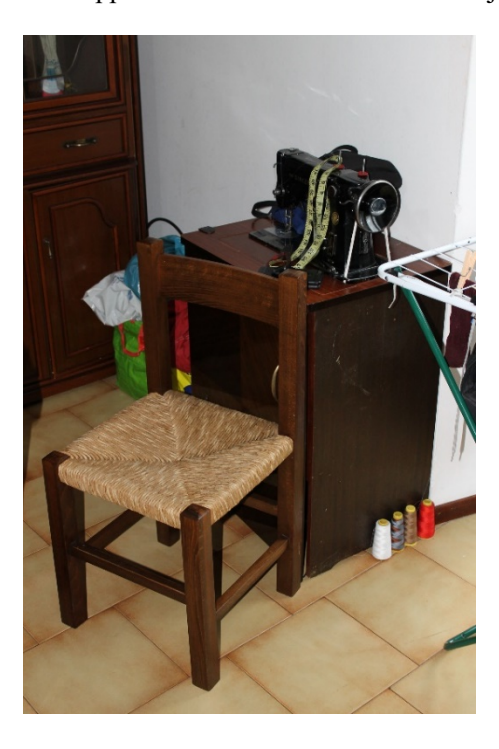
Figure 4: Moussa's sewing machine

MOUSSA: I'd like to, but now I'm apprentice in a farm. I don't like that job! [Our translation]