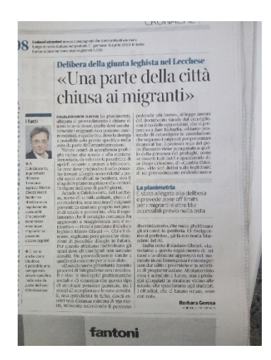
Figure 2: A national newspaper announcing, 'A part of the city closed to migrants' (Corriere della Sera, April 11<sup>th</sup>, 2019)

Drawings and stories illuminate the effects of public discourse on newcomers' experience. An example: on April 11th, 2019 newspapers and social media gave relief to an ordnance from the Mayor of Caloziocorte (LC), a city involved in our project, determining a new town planning scheme that banned reception facilities for refugees nearby schools and the train station and relocated apartments and centers at periphery. Newspapers bluntly titled 'A part of the city closed to migrants' [fig. 2]. Media and politicians often refer to 'migrants' as a generalized category; a not accidental mistake, reinforcing trivialization and construction of a generalized unwelcomed other. This policy of communication raises barriers nurturing fears, distrust and hate; the lack of spaces where it is possible to reflect and maybe challenge the meaning of words and decisions like the ones reported brings negative emotions to escalate and influences the use of space.